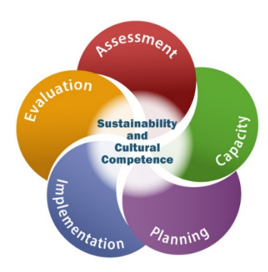
Figure 1: SAMHSA Strategic Prevention Framework (SPF)

To effectively implement the strategic plan, Nevada's substance use disorder (SUD) prevention and treatment service system must have sufficient capacity to meet identified needs. The Rural Region Regional Behavioral Health (RBH) Policy Board oversees behavioral health planning and resource development for the region. Created by the 2017 Nevada Legislature, the RBH Policy Boards (Northern, Washoe, Rural and Southern regions) consist of 13 members each and, in accordance with NRS 433.4295, advise DBPH on matters pertaining to behavioral health issues, promote improvements in the delivery of behavioral health services, coordinate with other regional policy boards and submit a report to the Commission on Behavioral Health.<sup>2</sup>